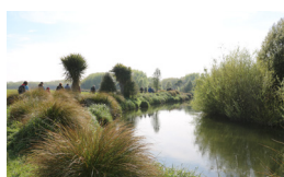
Harts Creek Walk