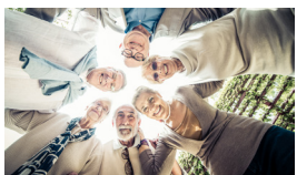
Malvern Club Day