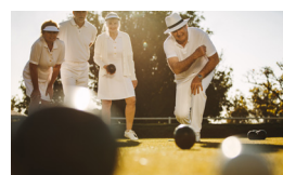
Table Tennis, Pickleball & Bowls Have-a-Go!